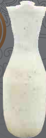
جگ دوغ Dogh