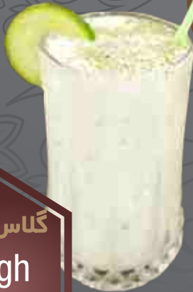
گلاس دوغ Dogh